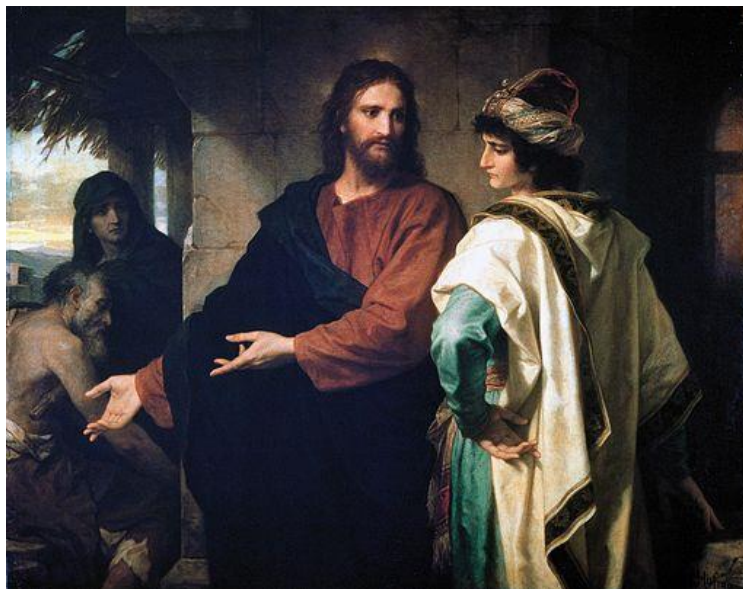
Christ and the Young Rich Ruler - Heinrich Hofmann

[Spiritual sacrifice is an] avenue to evolutionary progress [that when] faithfully, devoutly, and lovingly made, hastens our ultimate development and the perfection of our Golden Wedding Garments.