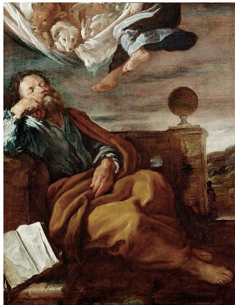
Jonah and Whale (above) and Peter’s Vision of Animals in a Blanket