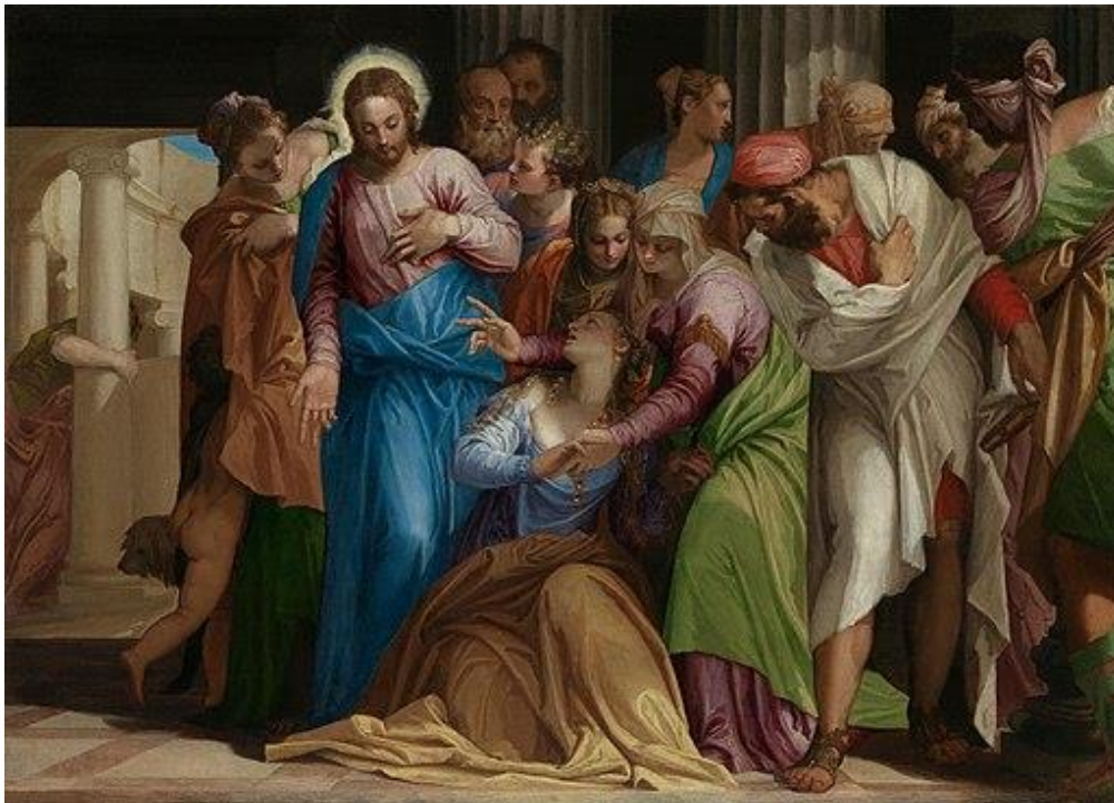
The Conversion of Mary Magdalene - Paolo Veronese

A woman burned at the stake was seen, A child of love and light; Behold! Mary the Magdalene, A red rose turned to white.