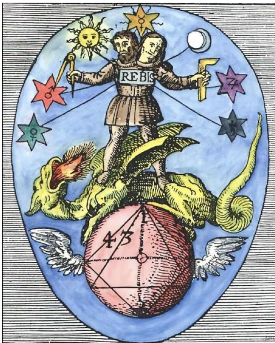
The Androgenous Man

Glorious Destiny has lain hid in the Divine Plan for humankind since the beginning of time.