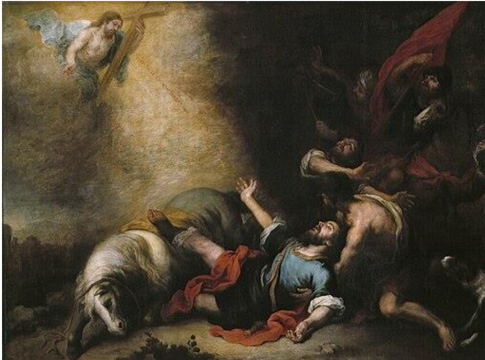
The Conversion of Paul - Bartolomé Esteban Murillo