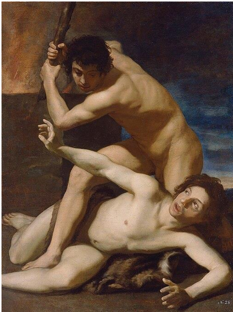
Cain Kills Abel – Bartolomeo Manfredi

The individual ray is retained by the Spirit throughout its whole series of lives, and perfectly independent of the horoscopical rays which change according to its birth, environment, and the lessons to be learned in each life.