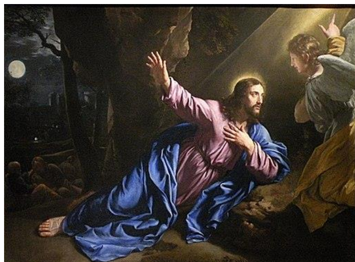
Christ on the Mount of Olives - Philippe de Champaigne

“May you walk always in the Light as He is in the Light, and may you always live and move and have your being in Him.”