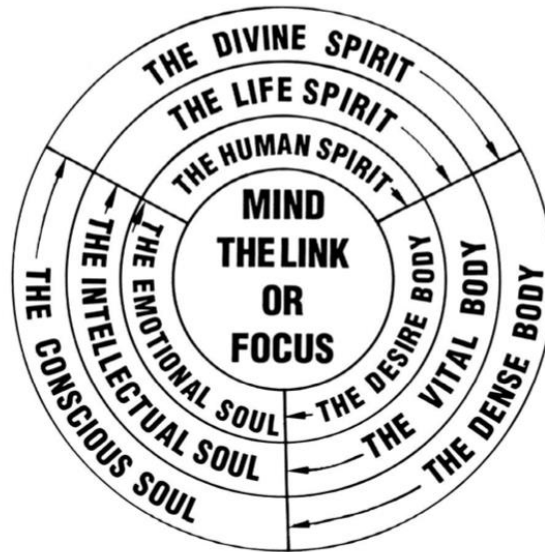
DIAGRAM 5 SHOWS THE TENFOLD CONSTITUTION OF MAN

One of the main functions of the Rosicrucian School of Spiritual Healing will be to teach the Rosicrucian methods of maintaining health in accordance with the underlying principles of the Ten-Fold Constitution of Man .