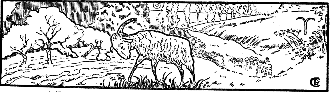
A Character Delineation of the Children Born between March 21st and April 20, inclusive, 1930.

The children of Aries are wiry, swift-moving, and of an impulsive, enthusiastic, and often quick-tempered disposition. The typical Arian child must be heard. He refuses to take a back seat. He must be noticed or you will hear from him, for he is not backward. If he can not lead he may refuse to play, and he is ever ready for an argument. He feels he must accomplish what he undertakes in a very short time, and if the work drags or is held back, he will lose patience and often throw it up, leaving the Taurian to come along and finish the job. On account of the Arian's rebellion against being led he does not make a very faithful employee; he ever rebels against leadership. While he is quick-tempered he is very quick to forgive.