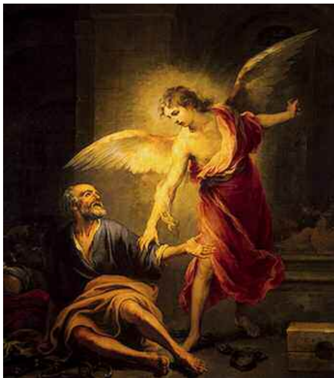
Bartolome Esteban Murillo, State Hermitage Museum, St. Petersburg, Russia

There are several instances in the Bible of the temporary suspension of certain physical laws, such as gravity and the conduction of heat, but never merely for show. Christ walked upon the water in order to reach the boat in which His disciples were being tossed about by a “contrary” wind. The lives of Shadrach, Meshach and Abednego were preserved in the “seven times heated” furnace. The “gift of tongues” was not given originally as a “sign.” It was given, as recorded in the second chapter of Acts, for a specific purpose; i.e., in order that the foreign-born Jews in the city of Jerusalem might understand the gospel when it was preached. One modern recorded instance of the gift of